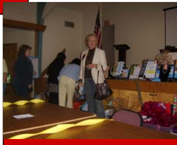
Right: Look at all those raffle prizes!